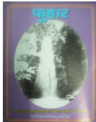
Phuhar: An Activity Book

A set of activity book 'Phuhar' was developed by the SSA, Uttarakhand which contains various kinds of activities to enhance the physical, cognitive, language and socio-emotional development of children.