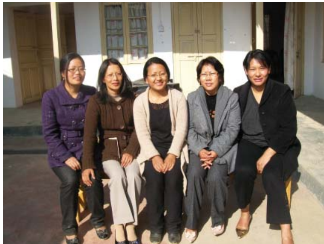
Diploma Holders with ECCE Coordinator

Apart from that, SCERT, Nagaland had taken initiative to create linkage between pre-primary and primary schools and also to produce ECCE programmes in local context as well as monitor and evaluate ECCE activities at all levels. ECCE diploma holders are also involved in the 'development of curriculum and syllabus for government pre-primary schools in Nagaland'.