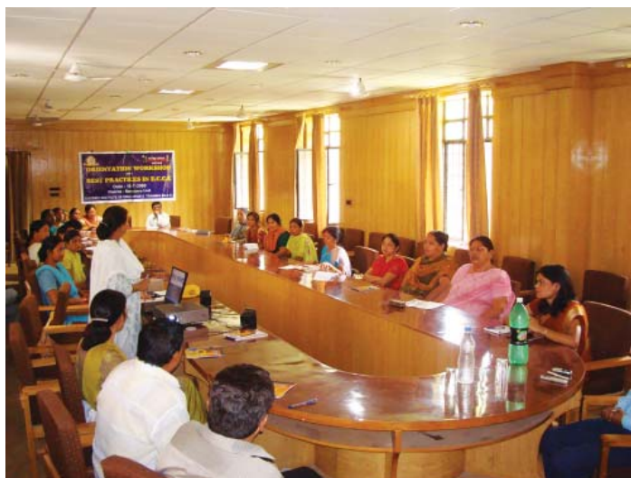
Orientation Workshop in DIET, Uttarakhand

series of ECCE programmes were conducted, which usually catered to the most backward and needful ECCE centre, that is Anganwadi .