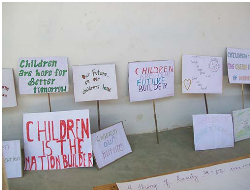
Material for community awareness

Recognising the importance of awareness about ECCE among stakeholders, SCERT conducted 'Community Awareness Programme' in all the Districts of the State of Nagaland during June-July 2010. Pamphlets, posters and road hordings were prepared with the help of ECCE trained teachers.