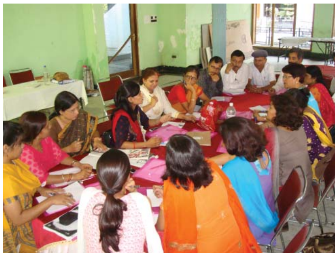
Workshop for Development of Material for AWWs

During the observation of selected Anganwadis to which ECCE diploma holder has given training and orientation, it was found that all the Anganwadis were decorated with teacher made TLM. Before coming to the AW centres all AWWs prepare lesson plan and they conduct the activities according to the domains of development like beading, drawing, welcome song, poem, hide and seek and physical exercise, etc. They were also found very confident during story telling with the help of gestures and self prepared TLM like puppets and flash cards, etc. All the AWWs maintain teacher's diary and keep records of the progress of children based on the daily observation of each child. Keeping in mind the busy schedule of parents every week they organise Parent Teacher Association (PTA) meeting and also to ensure the mother's participation they organise