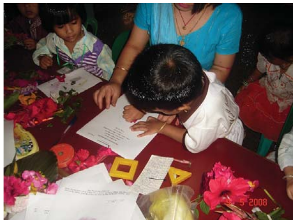
Follow-up activity on Flowers' day