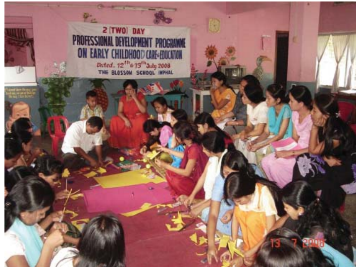
Participants doing Paper Craft during a Workshop

Apart from dealing with the young children, the Blossom School caters to the ECCE functionaries also. Underneath that a 'two-day professional development programme on ECCE' was conducted from 12 to 13 July 2008 in school premises in which more than fifty pre-school teachers from various schools and