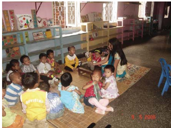
Children doing Solid Pouring Activity