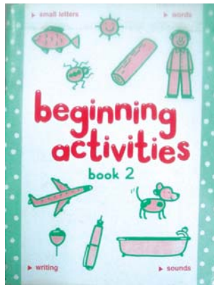
Children's Activity Book

there is no open space for outdoor activities because of the busy and congested roads, therefore, it has been arranged in indoor area with tent house, slides, strings, racing pony, racing snake and a ball house for jumping activity. Indoor space is divided into dolls corner, blocks corner and painting/free expression corner. The whole classroom is equipped with Montessori equipments, teacher made material and commercial material too. School is having children's library and books corner. Children's books consist of art book, number book, alphabet book and drawing book.