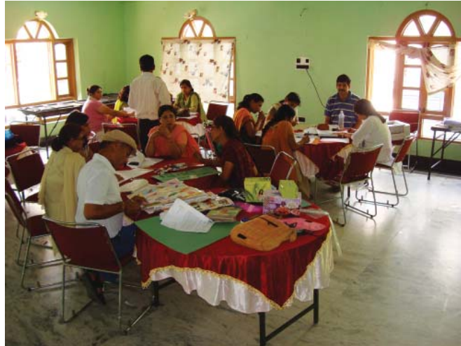
Workshop for the Development of Material for AWWs

A 'workshop for the development of TLM and instructional manual for Anganwadi Workers' was conducted from 16 to 22 July 2009. The main objective of the programme was to