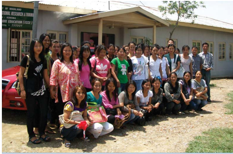
Trainees of certificate course in ECCE, Nagaland

School Headmistress and proprietor's of schools practising different methods and Health and Family Welfare Department (HFWD) discuss the issues. The mode of teaching is discussions, lectures, demonstrations, presentations, observations during visits, mock sessions and development of TLM.