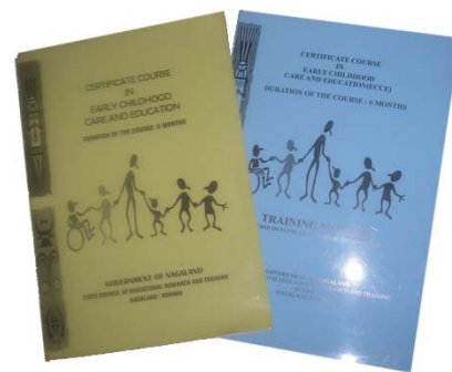
Training Module and Syllabus