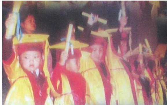
Kindergarten Graduation Ceremony

Various kinds of activities for the holistic development of children are being done in Kindergarten like flowers day, hand print day, shopping day, friendship