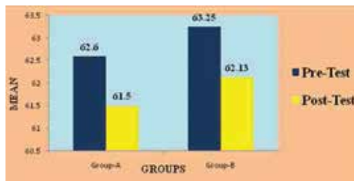
Graph 2 Graphical representation of Data

As the differences between mean including the two test of Group-A is not significant at 0.05 or even 0.01 level (Garrett, 2005). The actual difference between the means may be due to chance or accident and it is not due to opportunity provided to the group by teaching through ICT and by allowing the students to learn/practice by using ICT.