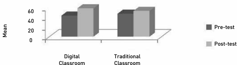
Fig 3. Mean score of digital and traditional classroom learners of both the schools together

The data and graph given above show that the academic performance of the experimental group has improved much more than the control group. The two-tailed p value (.01) indicates that the performance of the two groups is extremely significant. The computed 't' value (2.77) is highly significant at both 0.05 level as well as 0.01 level. This indicates that those learners taught by using digital technology has better performance than the learners taught through traditional chalk and talk method. On the basis of this analysis, it is clear that the Hypothesis 2 (there is no significant difference in academic achievement of secondary school learners of traditional class and digital class) is rejected.