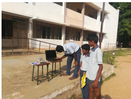
Testing the range